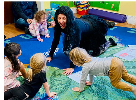
Storytime Yoga with Robin's Yoga Nest is always a treat for our littlest yogis!