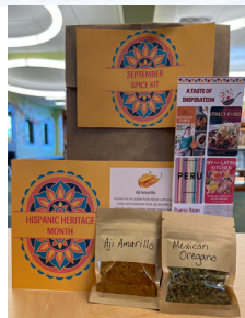
Our Spice Library, the brainchild of Library Clerk Melissa Orland, introduces patrons to new and unique flavors each month