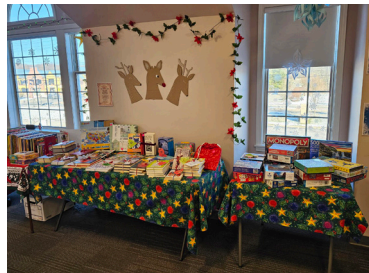
Our Holiday Book Sale was a festive sight and brought in over $900!

Fundraisers, like our book sales, are run almost entirely by volunteers, with proceeds helping the library to continue providing materials and resources for our patrons.