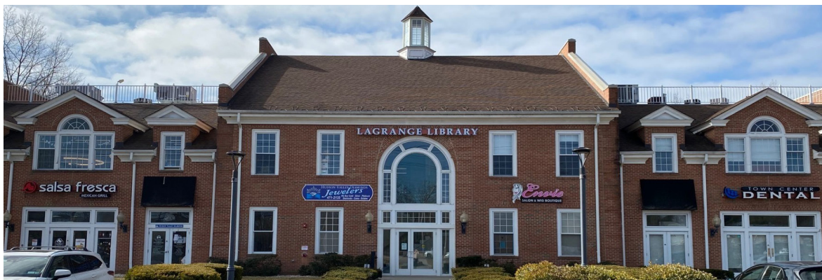
"The only thing you absolutely have to know is the location of the library." – Albert Einstein

Donations of any amount are gratefully accepted by scanning here