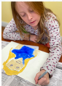
Families visiting the library can expect some of the best art programming in the area, and all for free!